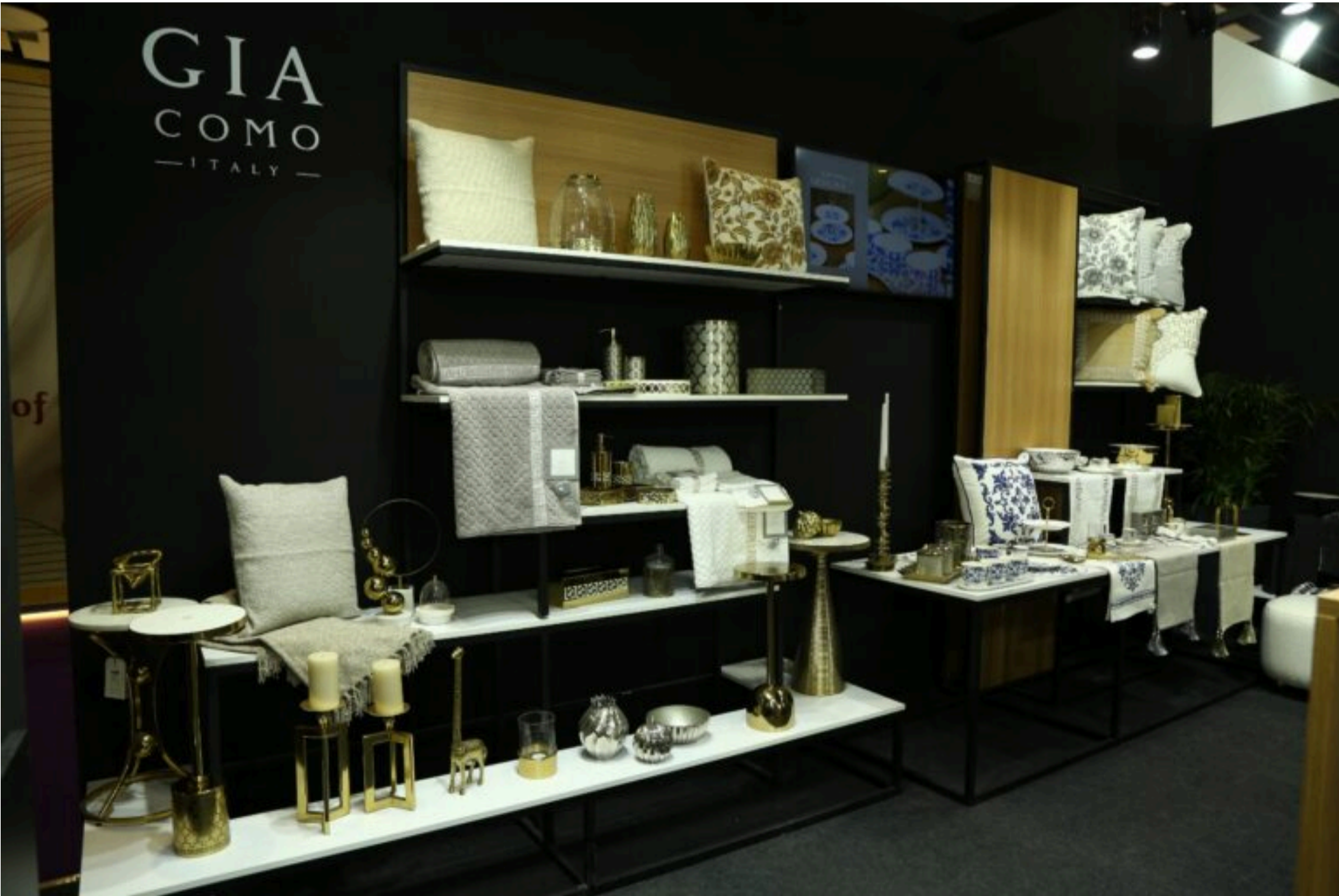
PDS leverages Bharat Tex 2025 to strengthen global partnerships, engage with key stakeholders, and highlight its extensive expertise in fashion infrastructure, responsible sourcing, and supply chain transformation.